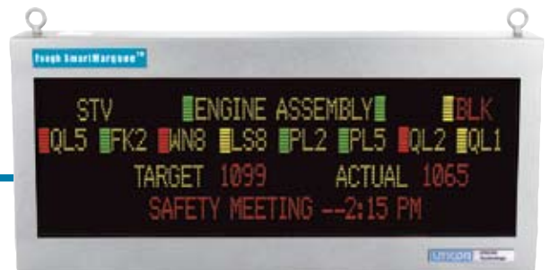
Slave Tough SmartMarquee