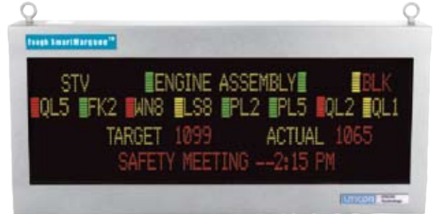
Master Tough SmartMarquee

Control Network e.g. DH+, Ethernet I/P etc. Tough SmartMarquee acts as an Intelligent device on one of the network nodes.