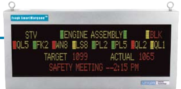
Slave Tough SmartMarquees

IPC with SCADA Software or a Master PLC sending ASCII strings