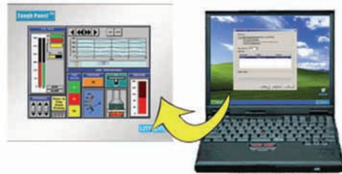
Upgrade Screens/Projects via Email without Programming Software

The OEM sends the new program by email (as a zip file with simple and automatic unpacking) or makes it available on their website for downloading. The end user needs only web access and a laptop computer.